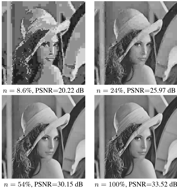
Fig. 2. Four sample decodings from the optimal progressive fractal code. n is the size of the partial codes. The PSNR is for the reconstruction error.

parameter tuples (D_i, s_i, o_i) , i = 1, \dots, n_R are placed one after the other in a fixed order determined by the partition. The reconstructed images at four stages of the practical progressive code are shown in Figure 2.